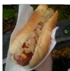
Massive Wieners 11 ❤️