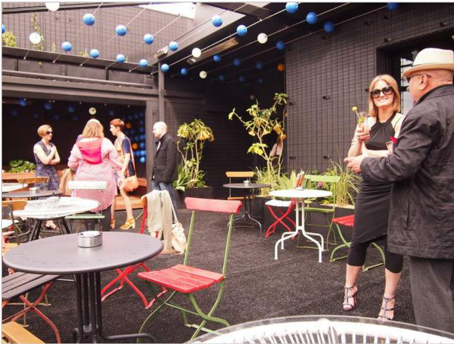
Loop Roof. large image

Loop Bar is on the ground floor, but there are plenty of businesses in the building separating Loop from its roof. There are three floors worth of stairs to conquer before arriving at the adorable roof area.