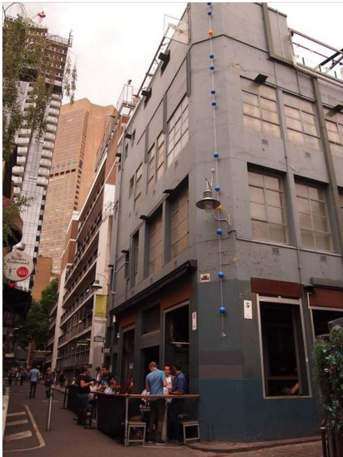
Loop Roof is all the way at the top of this building. large image

Loop Bar is on the ground floor, but there are plenty of businesses in the building separating Loop from its roof. There are three floors worth of stairs to conquer before arriving at the adorable roof area.