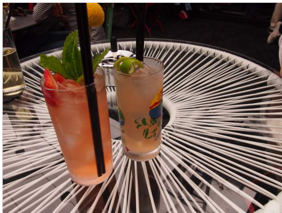
Cocktails from Loop Roof.

Melbourne's newest hot spot, Loop Roof , is an astro-turfed, intimate affair with an impressive bar.