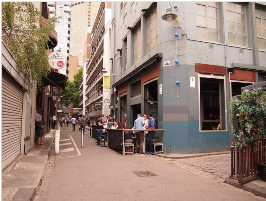
Meyers Pl, Melbourne large image

Help us improve Click here if you liked this article 64 ❤️