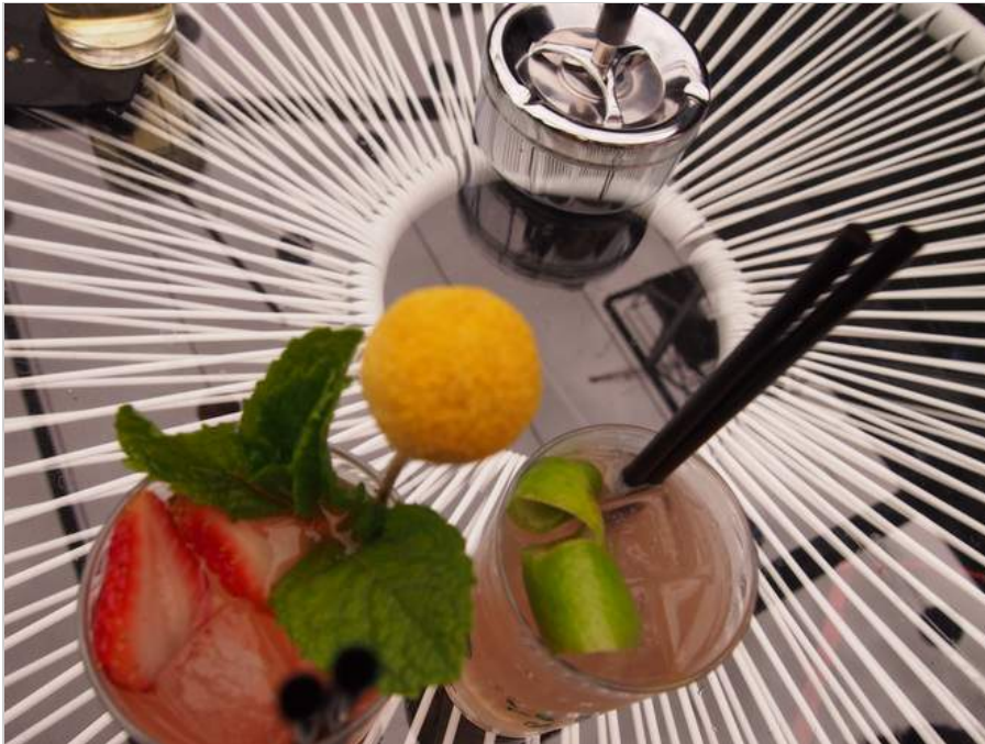
Strawberry Fields Forever and Luna Loco cocktails at Loop Roof.

I tried the Strawberry Fields Forever cocktail and its bitter cousin, the Luna Loco . The Strawberry Fields Forever was pleasantly sweet; the vodka and gin in it almost undetectable. It tasted weak, but taste can be deceptive. The Luna Loco , which was characterised by apricot brandy and orange bitters, tasted quite strong by contrast. Perhaps the bartender overdid it on the bitters. The cocktails were served in regular drinking glasses, rather than fancy cocktail glassware.