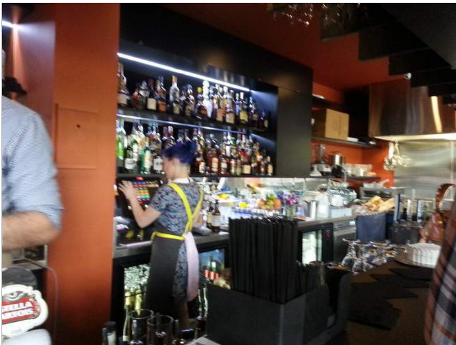
A small section of the well-stocked bar.

The bartender took about ten minutes to make the cocktails- and the wait wasn't for dilly-dallying. He carefully measured out quantities of each ingredient, taking his time to make sure they were just right. He even freshly cut up the decorative strawberry. He did say that it was his first day on the job, so perhaps by the time you visit he will be expertly whipping together drinks in a matter of seconds.