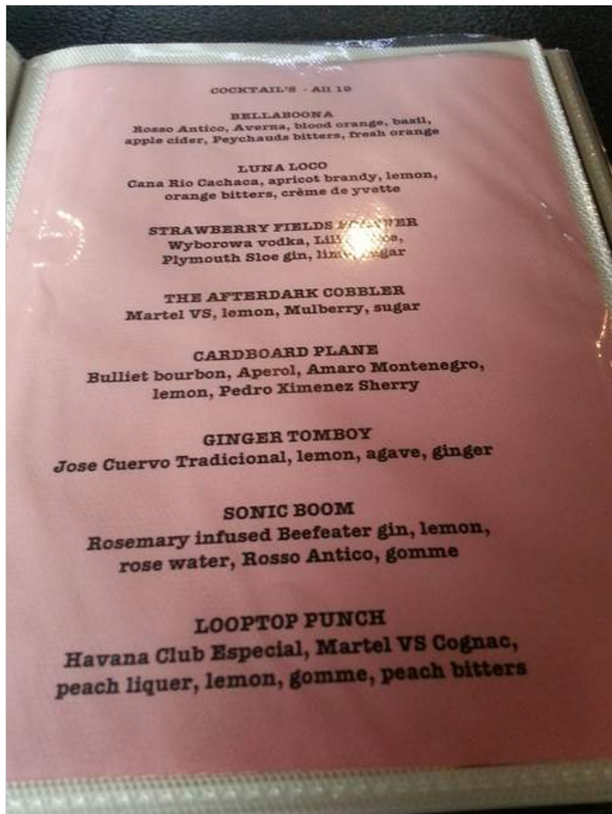
The cocktail list at Loop Roof. Each cocktail costs $19.

The drinks menus are in kitsch photo albums. I noticed quite a few of the people there confused looking for a menu, not thinking that the flip books in front of them may hold what they were looking for. Perhaps those people had already downed too many of the delicious cocktails.